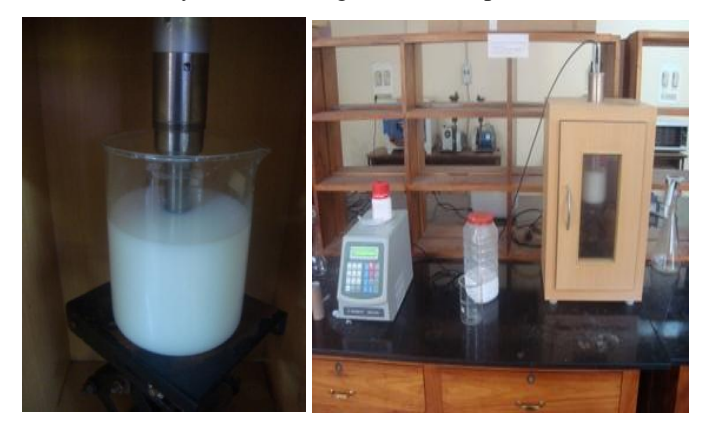
Figure 2: Photographs of Nano Fluid: (a) Mixture of TiO2 and Base Fluid in Conical Chamber, (b) Ultrasonic Vibrator Experiments